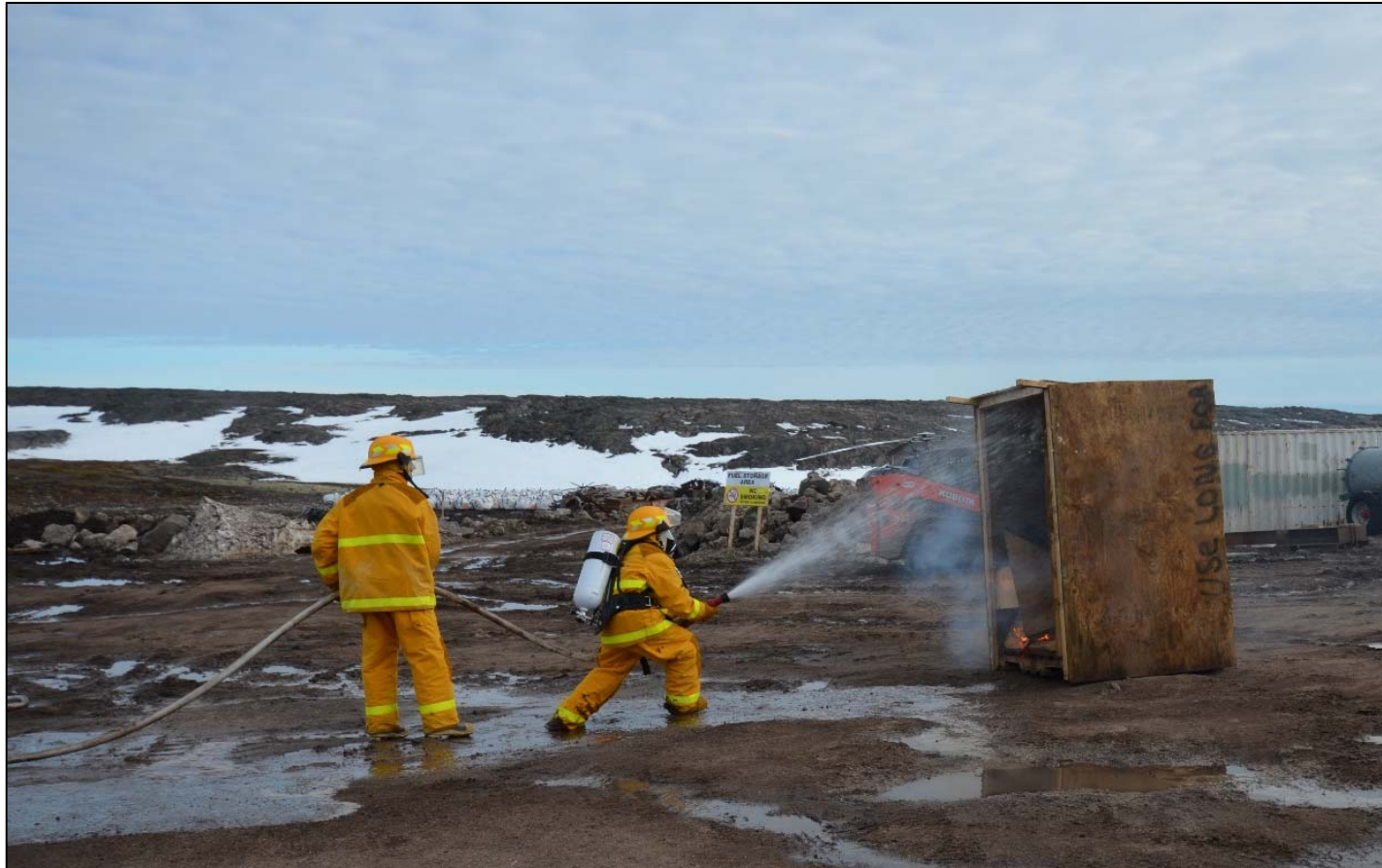
Firefighting exercise hosted by Iqaluk Toonoo