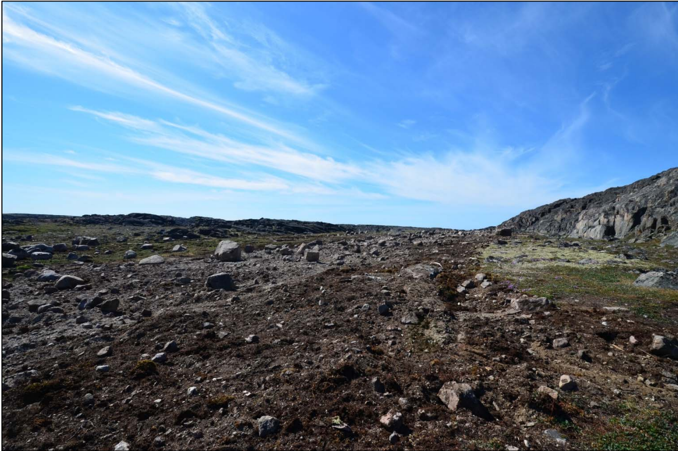
Regraded site access road