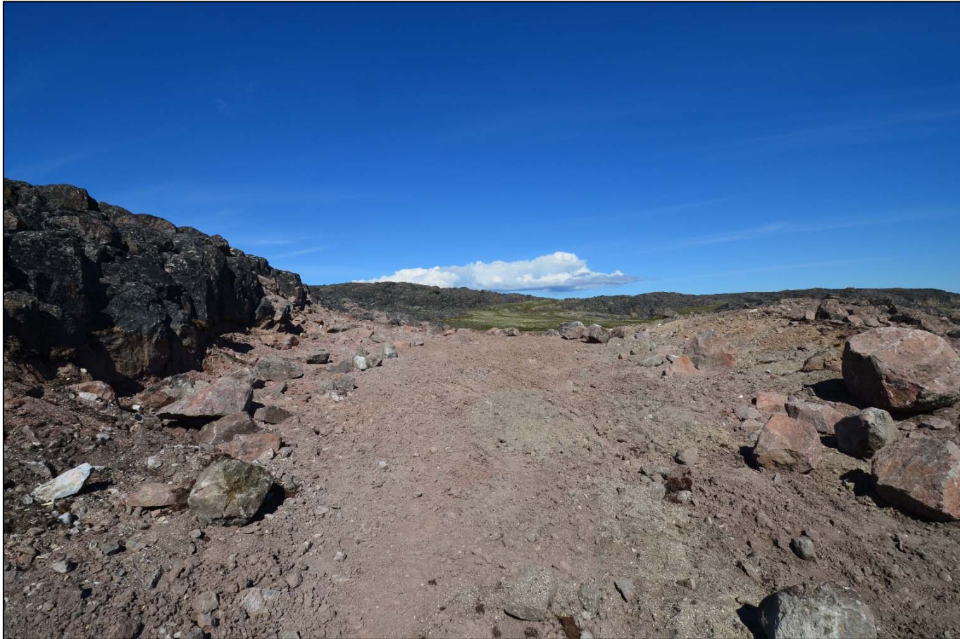
Regraded Borrow source