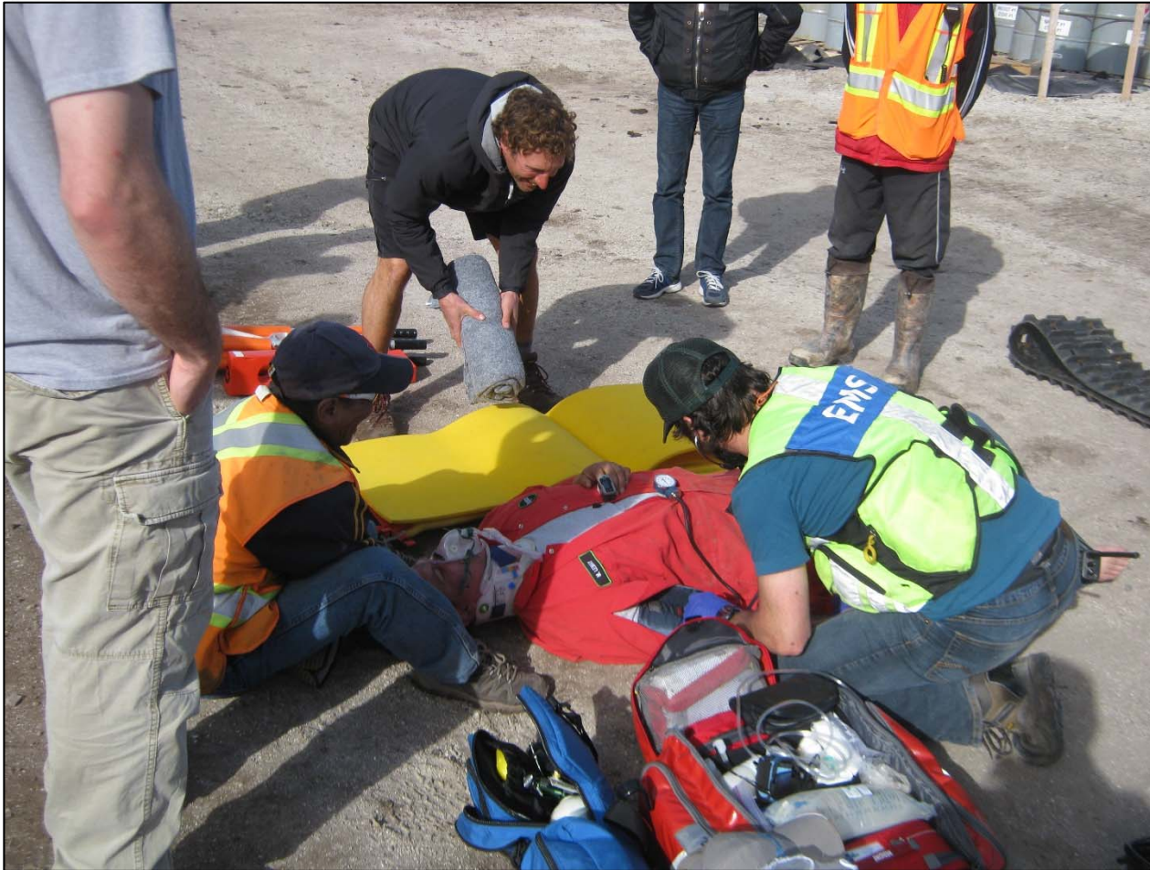
Emergency response training